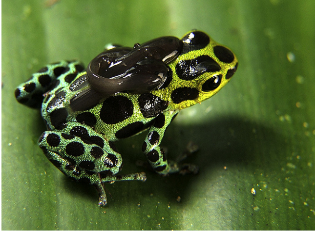
Figure 1. The poison frog Ranitomeya variabilis , carrying its larvae. In this species male parents transport their offspring to phytotelmata (typically water-filled leaf axils of bromeliad plants). Tadpoles are usually transported singly but sometimes two or three tadpoles can be found on the back of the male parent.

Ranitomeya examine phytotelmata before the deposition of a new larva and avoid already occupied pools (Weygoldt 1980; Zimmermann & Zimmermann 1984; Summers 1990; Brust 1993; Caldwell & de Araújo 1998; Caldwell & de Oliveira 1999; Summers 1999; Poelman & Dicke 2007; Brown et al. 2008a, b; Stynoski 2009). Furthermore, it may also be advantageous to distinguish between tadpoles with different feeding strategies. Deposition of tadpoles with noncannibalistic tadpoles could be advantageous as these could serve as prey items. On the other hand, competition risk could also increase within the small phytotelmata. In terms of egg deposition, noncannibalistic tadpoles may pose a potential threat, as larvae of several anuran species have been shown to feed on anuran eggs (Jungfer & Weygoldt 1999). Poelman & Dicke (2007) showed that Ranitomeya ventrimaculata typically deposited eggs away from tadpoles at the beginning of the rainy season to protect them against cannibalism, but as the dry season advanced, they placed clutches within reach of previously deposited tadpoles to speed their development. Several congeners are known to feed their offspring trophic eggs to offset low resource levels of small phytotelmata (Caldwell & de Oliveira 1999; Brown et al. 2008a). This egg-feeding strategy is seen in some nondendrobatids as well (Jungfer & Weygoldt 1999).